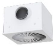
Side entry, circular spigot