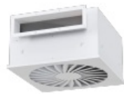
Side entry, rectangular spigot